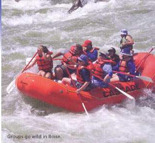
Groups go wild in Boise.

Colorado Springs, the state's second-largest city in the heart of the Pikes Peak region,