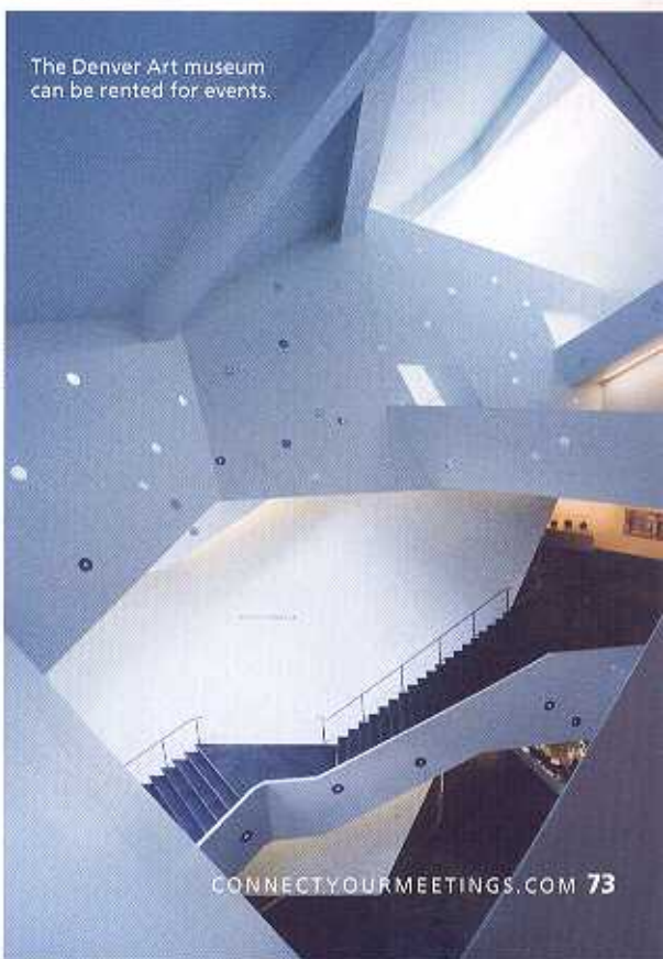
The Denver Art museum can be rented for events.